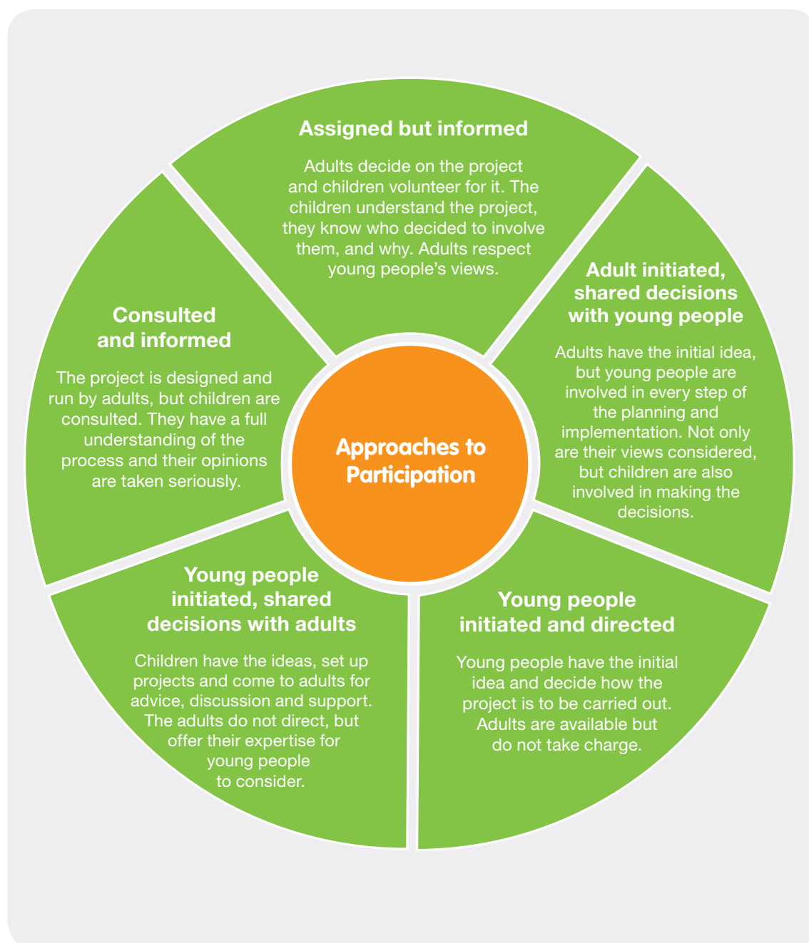
Figure 2: From Treseder, P. Empowering Children and Young People . London: Save the Children (Treseder, 1997).

The following examples show how the model can be used to understand and measure diverse kinds of participation. The first two examples are one-off projects developed with the community and the third is an ongoing process of organisational development which engages young people. It is important that children and young people have opportunities to participate in enduring activities as well as time limited activities with a specific purpose and goal. This might be participation in school or policy development, input into the choice of activities in the classroom, or the use of reflection strategies to understand the full participation story over time.